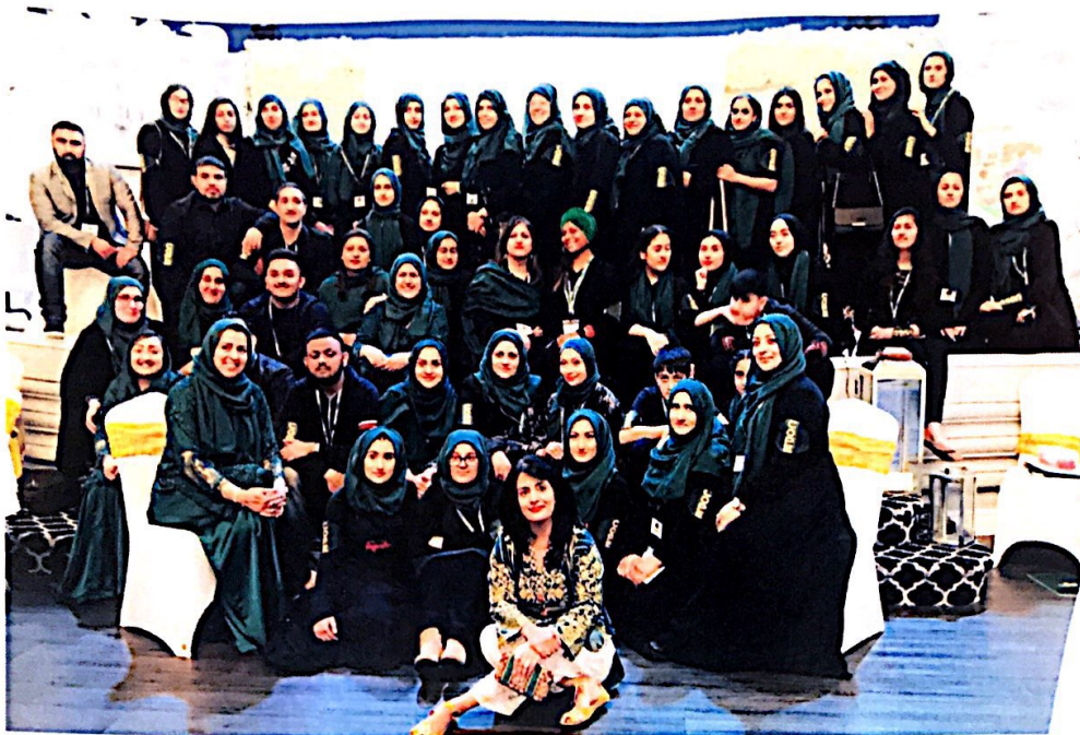
THE COPE TEAM AT THE RAMADAN IFTAR ON 11 MAY 2019