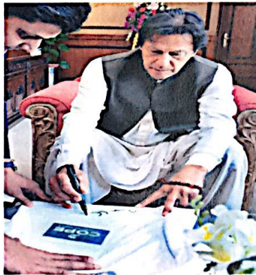
Above: Pakistan Prime Minister, Imran Khan signing a t-shirt for COPE's auction

well cake and an impressive T shirt, signed by the Prime Minister of Pakistan, Imran Khan! Overall, the night ran smoothly and gave an amazing kick-start to the COPE Water Project, as a whopping £55,000 was raised. Well done COPE, and a huge thank you to the incredible volunteers, wonderful hosts and the brilliant sponsors. The event would not have been a success without you!