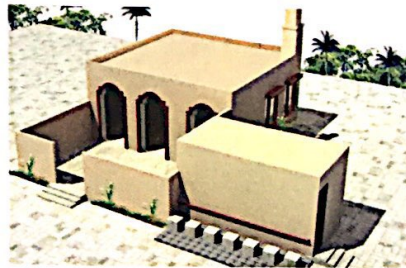
Above: Blueprint of the COPE Mosque in Balochistan.

enabled us to give the go ahead for the new mosque. The construction is expected to be complete by the end of October this year, and we will keep you fully updated on how it is coming along.