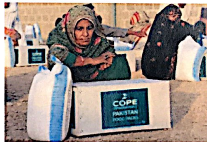
Above: Poor People came to collect their food packs

Before Ramadan began, we had a fundraiser for food packs. These consisted of flour, rice, sugar, cooking oil, lentils, gram flour, dates, Rook Afza, salt, spices and a matchbox. These necessary items were enough to feed a family of 5 during the entire month of Ramadan. In total, we funded 125 food packs. The superb support from donors and the gratitude expressed by the poor recipients of the food packs, has inspired and motivated us to fund an even larger number next year.